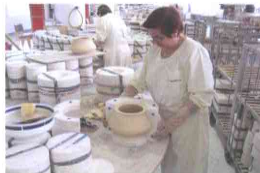
6.- DEMOULDING, once the piece was cast and the slip poured.