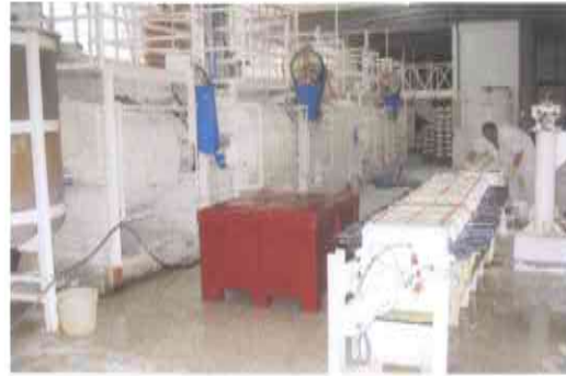
4.- PREPARATION OF BODIES AND GLAZES, mixing kaolin, quartz, feldspar and water, milling, filtering and kneading.