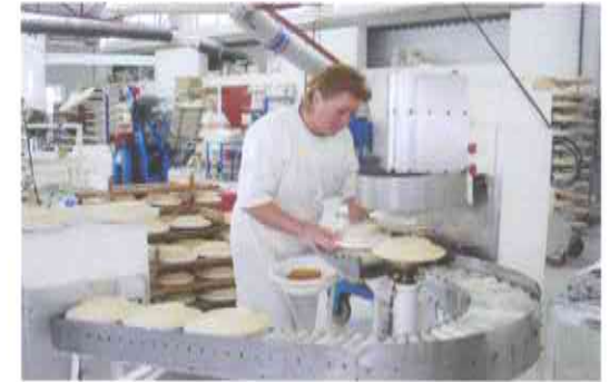
7.- PLASTIC FORMING, mechanical reproduction also on plaster moulds with plastic mass.