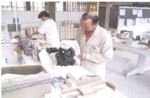
3.- ELABORATION OF PLASTER MOULDS FROM THE MODELS.