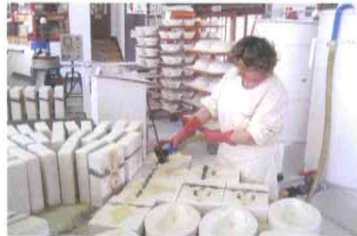
5.- FORMING BY SLIP CASTING WITH LIQUID PASTE, filling the plaster moulds, that absorb water and so a skin with the form of the figure is formed.