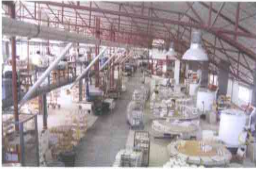
1.- GENERAL VIEW OF THE PRODUCTION PLANT.