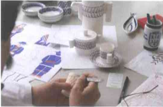
2.- DESIGN, CREATION AND PRODUCTION OF PROTOTYPES OR MODELS.