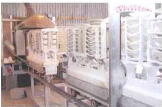
11.- VITRIFICATION, at high temperature, 1430 °C, firing in continuous tunnel kiln, in order to obtain white and translucent porcelain.