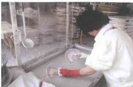
10.- GLAZING, applying the glaze by dipping, and so the colour remains covered until the glaze fluxes and reveals it after the firing.