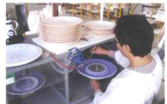
9.- UNDERGLAZE DECORATION, the pieces in their biscuit state are decorated by hand through stencils with aerographs.