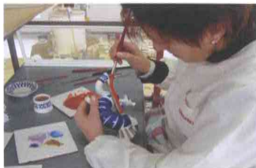
12.- OVERGLAZE DECORATION: Some pieces are decorated over the glazed porcelain and fired by third time at 800 °C.