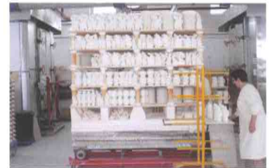
8.- BISCUIT, first firing at 800 °C, in order to handle the pieces, decorate them and apply the glaze.